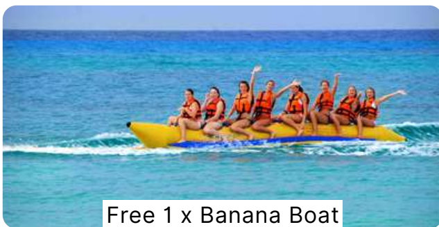
Free 1 x Banana Boat

Breakfast at hotel. Full day Tanjung Benoa with FREE 1 X BANANA BOAT (other activities own expenses), Lunch at local restaurant – continue to Coffee Factory and Kuta shopping Tour, Dinner at local rest. Back to hotel